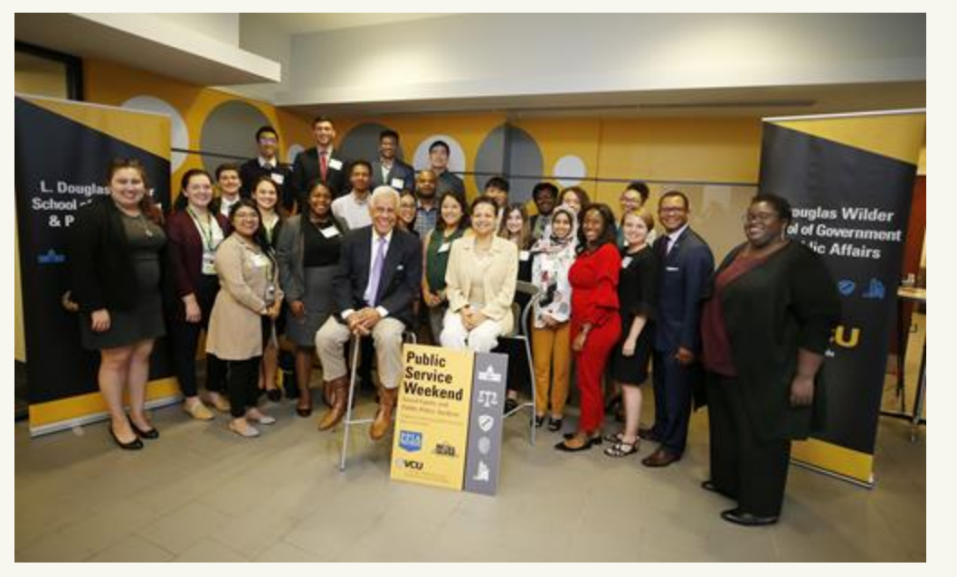
2019 VCU Public Service Weekend Participants

In conjunction with NASPAA, the membership association of graduate programs in public administration, public policy, and public affairs, PPIA hosts free Public Service Weekends to introduce more students to the broad range of opportunities available in the field of public service. Conferences include keynote speakers, panels, interactive workshops, and the opportunity to network with current and former public and international affairs graduate students. Visit ppiaprogram.org for more details and to access the application.