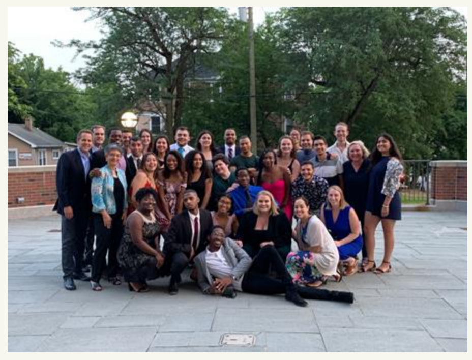
2019 University of Michigan Cohort

The PPIA Junior Summer Institute (JSI) is a rigorous academic preparation program for undergraduate juniors committed to public service. The program was started to address the lack of diversity across the spectrum of professional public service, including government, nonprofits, public policy institutions, and international organizations. The purpose is to prepare students to obtain a master's or joint degree, in public policy, public administration, international affairs, or a related field.